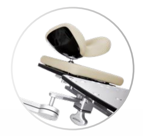
Plate and rail construction