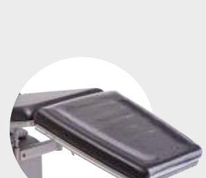
Protective cover for foot section

ART.NR. Z1.224 Genius ART.NR. Z1.223 Primus