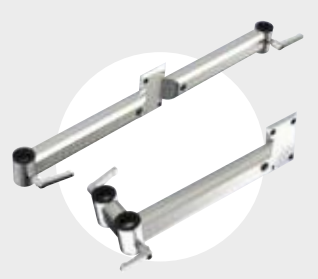
Mounting arm on both sides ART.NR. M.000703

Double mounting arm left ART.NR. M.000843