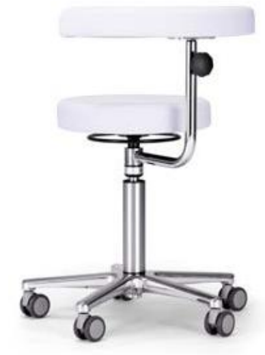
Operating stool COMFORT ASSIST