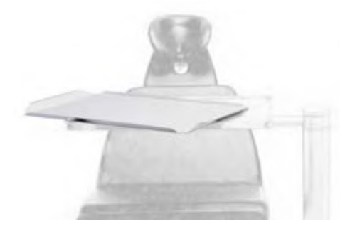
Plate size 700x500 mm ART. NR. Z1.278