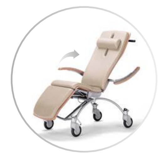
Armrests automatically adjusted to reclining position (foldable)