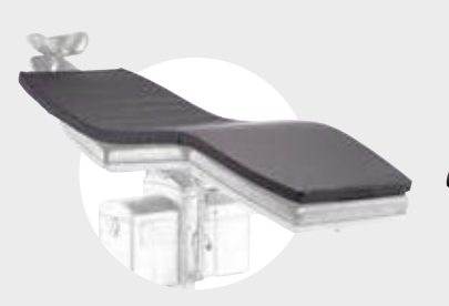
Mattress, viscoelastic ART. NR. Z1.171