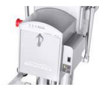
Integrated charging system – PRIMUS

Charge your operating table once a week by plugging in a cable. You directly save yourself the weekly change of the battery and do not need an additional storage place for the external charging station and the spare battery.